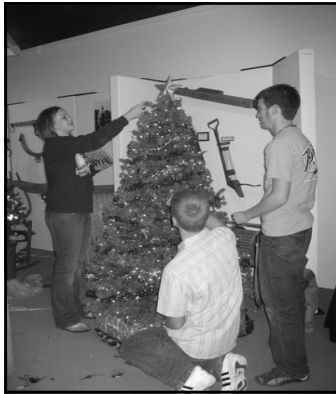
Members of Byron High School's Key Club decorating their tree at this year's Festival of Trees